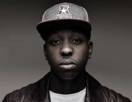
Jamal Edwards MBE Founder of SBTV

And companies want to help. Corporate social responsibility schemes are a fantastic force for good, and I intend to find ways to make them even more worthwhile, both for companies and communities.